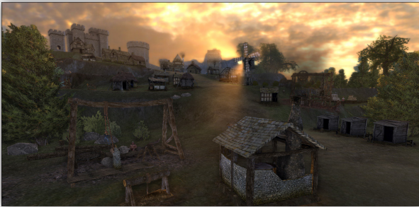
© 2011. Stronghold 3 - Firefly Studios