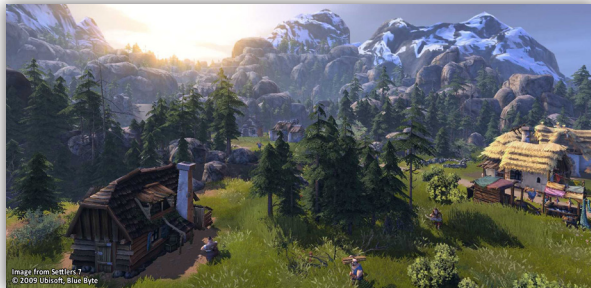
© 2010. Settlers 7 - Ubisoft / Blue Byte