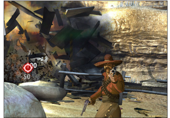
The Shoot uses Havok Destruction